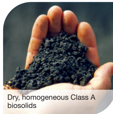
Dry, homogeneous Class A biosolids