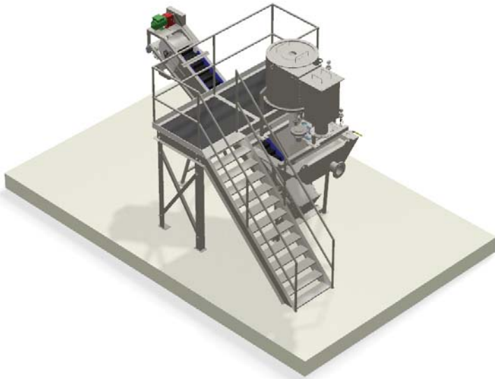
Eutek SlurryCup™ / Grit Snai® with optional access platform