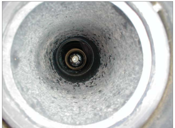
Overhead View of SlurryCup™ Vortex