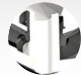
Optional UDM for non-threaded connections