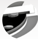
Advanced Technology EPDM Membrane