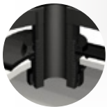
3/8 or 3/4 inch MPT (male) connection